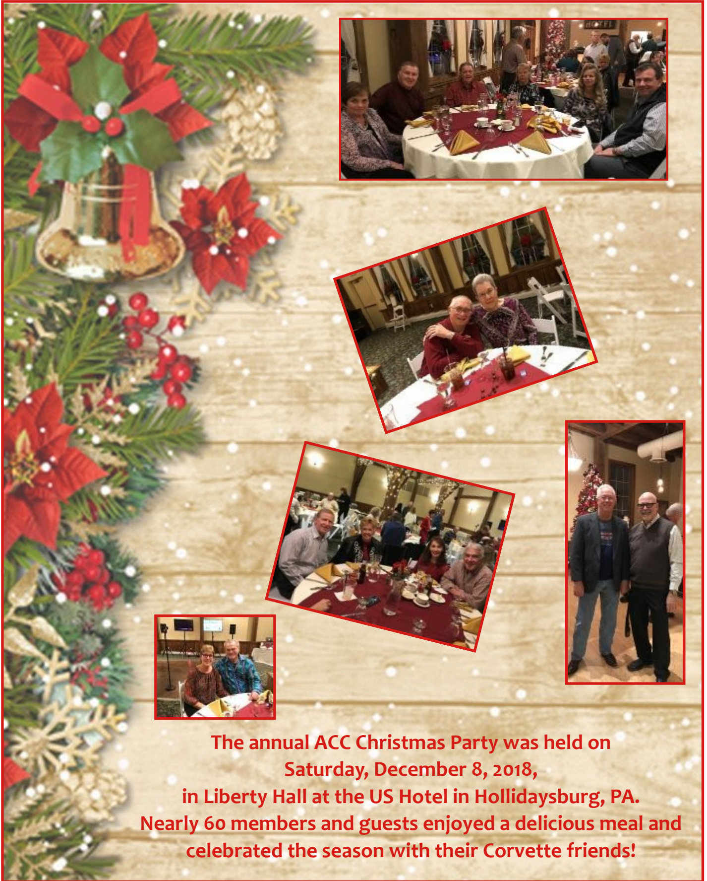
The annual ACC Christmas Party was held on Saturday, December 8, 2018, in Liberty Hall at the US Hotel in Hollidaysburg, PA. Nearly 60 members and guests enjoyed a delicious meal and celebrated the season with their Corvette friends!